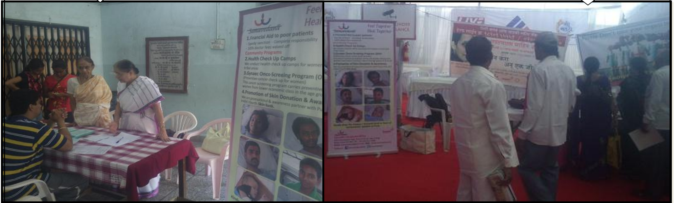
At SahakarNagar Mahila Mandal, Pune.

During Mega Blood Donation Drive By Samruddha Jeevan Foundation: 26 th Sept.13